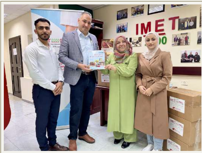
Al Quds University

The books cover a wide range of fields, including medicine, nursing, dentistry, higher education, and scientific research. This initiative aims to enrich academic resources, ensuring that students and faculty members have access to the latest global knowledge.