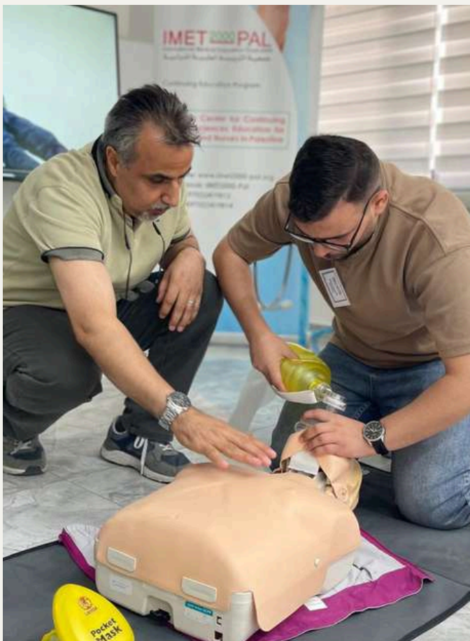
August 13, 2025 Friends Medical for Health Creativity Centre

The trainings were delivered by certified instructors accredited by the American Heart Association (AHA), ensuring participants received up-to-date, standardised instruction in line with international guidelines.