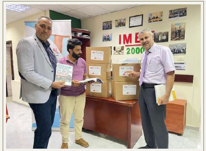
Modern College University

Through this programme, IMET2000 continues to strengthen Palestinian university libraries with advanced references, empowering both learners and educators to stay aligned with modern developments in health and research.