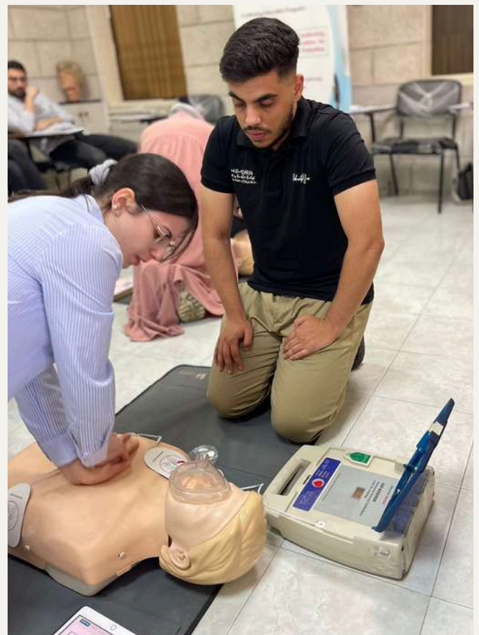
August 25, 2025 IMET2000-Pal Training Centre