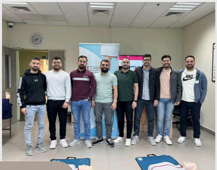
19 March 2025