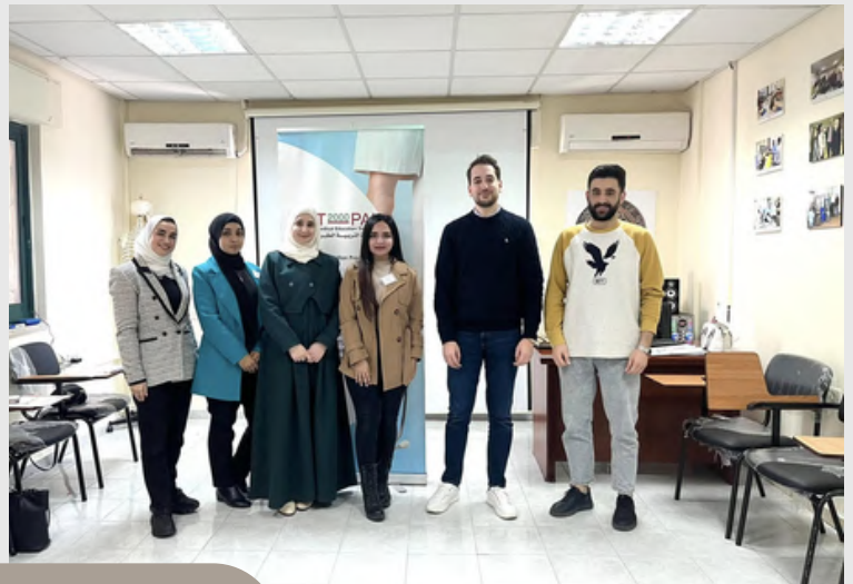
10 March 2025