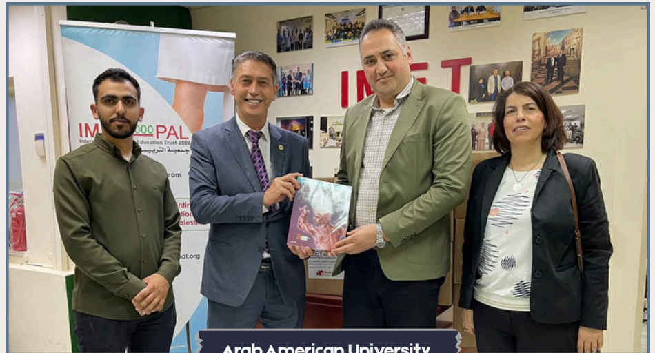
Arab American University Palestine

A new collection of specialised health sciences books has been delivered to American University Palestine, Al-Quds University - Abu Dis, and Hebron University as part of IMET2000's ongoing efforts to support Palestinian universities and expand access to scientific knowledge, in partnership with Book Aid International (UK).