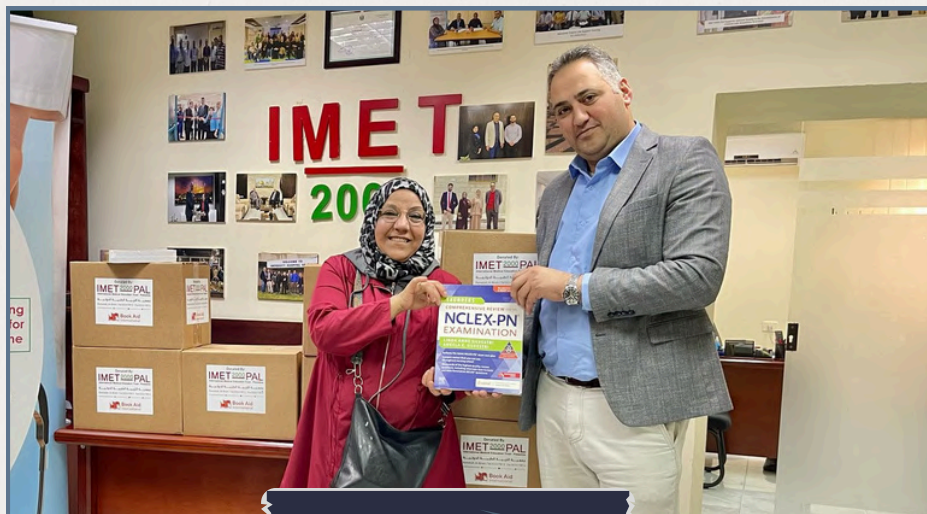
Al Quds University

More than a donation of books, this initiative is an investment in future generations of healthcare professionals. It reflects a shared commitment to strengthening educational resources, enriching academic learning, and advancing health sciences education in Palestine.