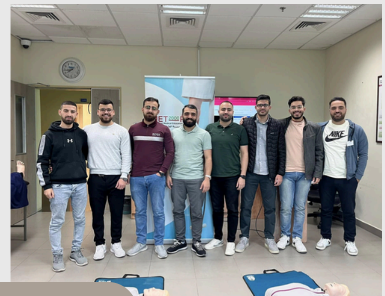
19 March 2025