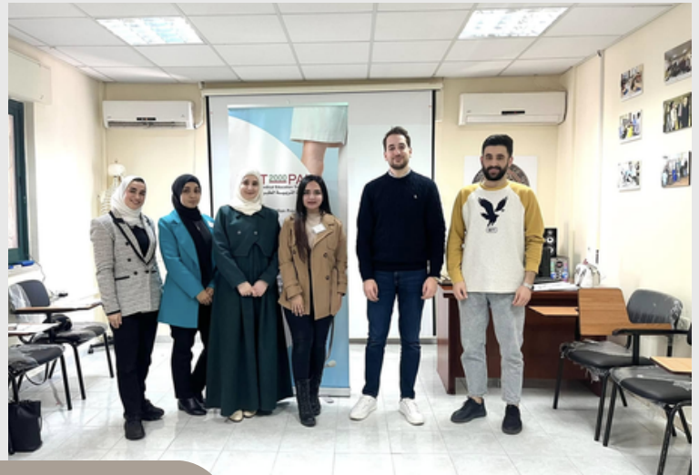
10 March 2025