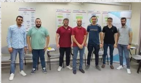
Day one: 8/8/2021

The workshops were attended by 31 doctors and Nurses from different hospitals in the West Bank at IMET Training Centre, Bethlehem University and An-Najah National University. these workshops aim to learn about Cardiopulmonary Resuscitation (CPR) for healthcare professionals, Automated External Defibrillation (AED) and First Aid. They were led by (American Heart Association “AHA”) Instructors.