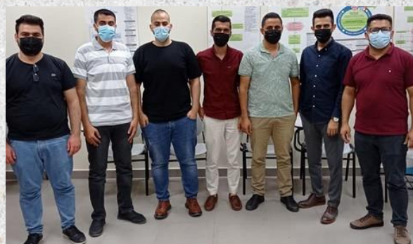
Day two: 9/8/2021