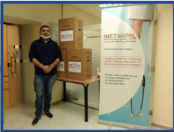
Deir Sharaf Village