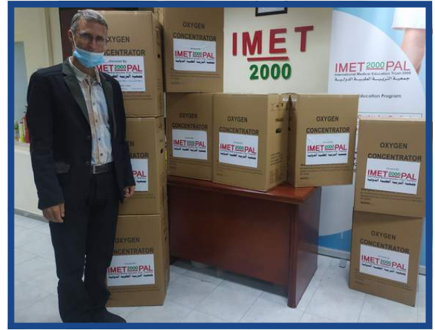
Al Kafreyat Municipality & Al Azb Al Gharby village