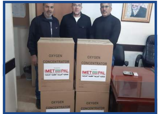
Qalandiya refugee camp