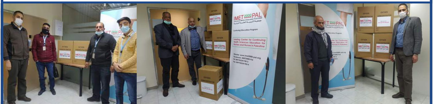
The Eastern region of Nablus