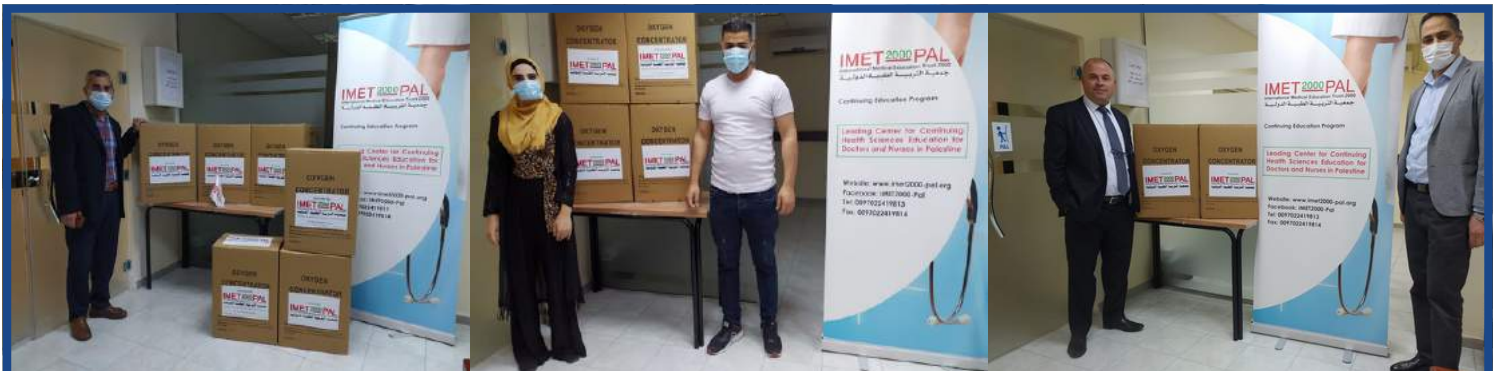
Kufrdan Municipality & Al Yamun Town

This month we have started distributing more than 50 oxygen generators to many villages and refugee camps across the West Bank. This was done to help the health sector in Palestine cope with the pandemic. As the number of cases rises, we hope to relieve hospitals by providing home-oxygen therapy for those who otherwise would have to be treated as in-patients. This primarily includes patients with mild to moderate COVID symptoms who do not necessarily require positive pressure oxygen therapy (CPAP) or ventilation in intensive care. This project also aims to discharge patients from hospitals as soon as it is safe to do so, in order to open up more spaces for people with serious symptoms.