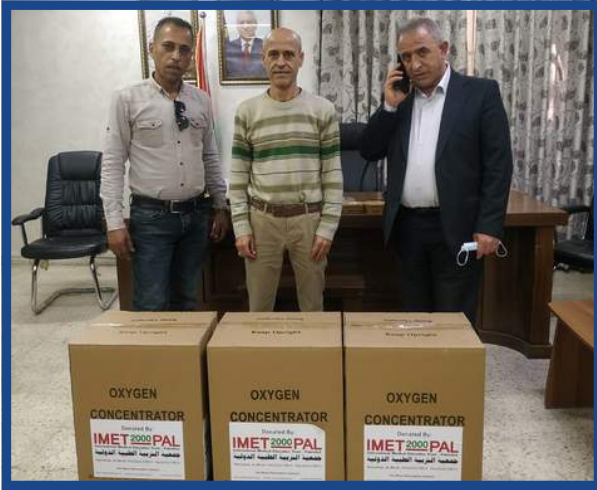
Balata refugee camp