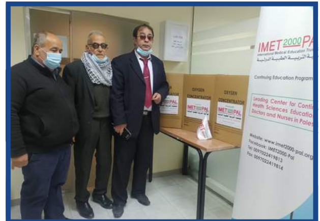
Al Fara'a refugee camp