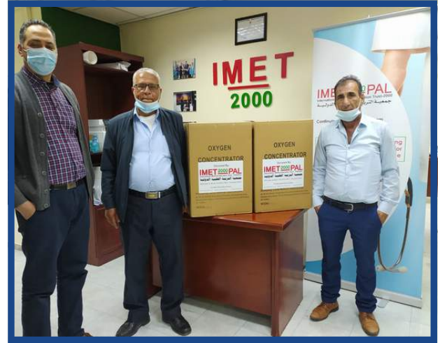
Municipality of Qatanna