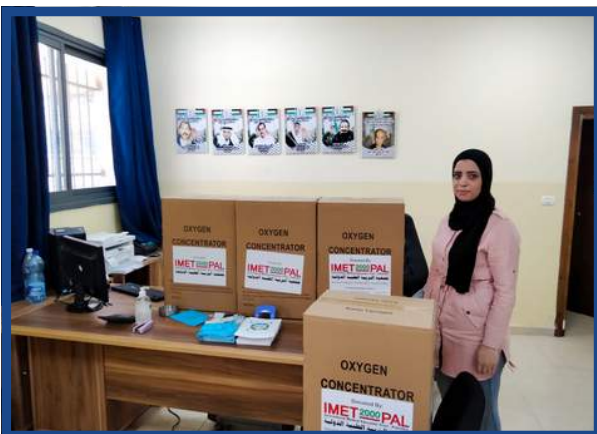
Am'ari refugee camp