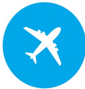
Travel Bursary Award